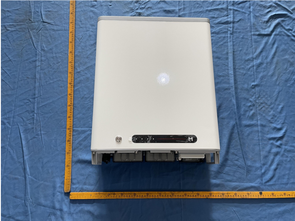
样品图片 (Sample photograph) -2