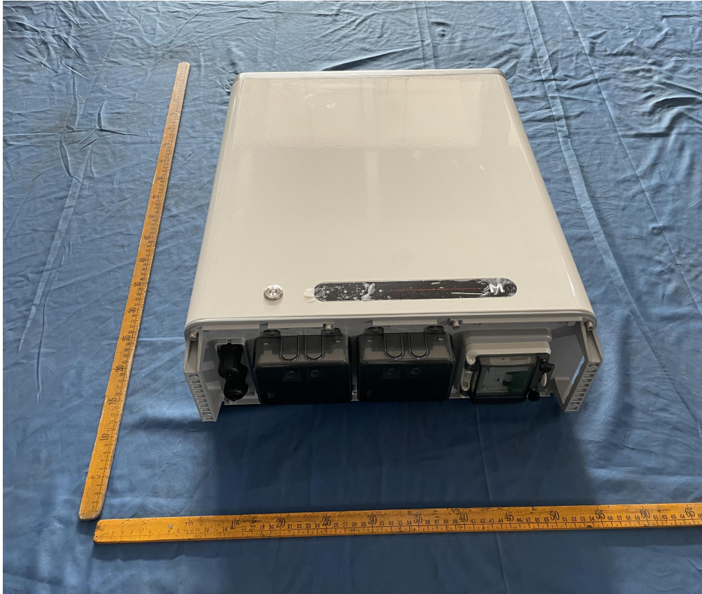
样品图片 (Sample photograph) -6